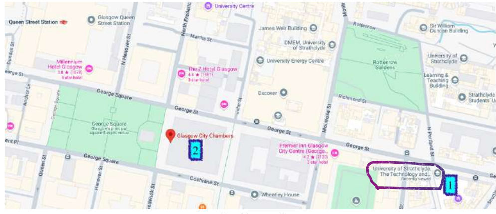
Arriving to Friday's Conference Venue